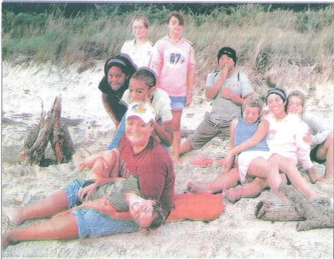
Local campers interact with campers from the world at Camp Silver Beach. For more information about Camp Silver Beach, visit www.campsilverbeach.org .

Contact YMCA Camp Silver Beach at 757-442-4634 or go to www.campsilverbeach.org .